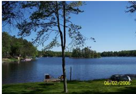
View from living room window.

The cottage is clean, attractively furnished, and ready for your carefree stay on the lake. It has two bedrooms, living area, dining area, and a bathroom with tub and shower. It is fully furnished with a modern kitchen. Included in the furnishings are cable T.V., DVD Player, AM/FM radio, alarm clocks, microwave oven, electric coffee-maker, gas range, and refrigerator. Also included are pots and pans, dishes, and bed linens. The cottage has vaulted ceiling in the living room and ceiling fans in the living room and both bedrooms. Outside the cottage is a Weber grill, picnic table, lawn furniture, and a fire ring. There is a pier off the shore where you can sit back and enjoy a relaxing view of beautiful Lake